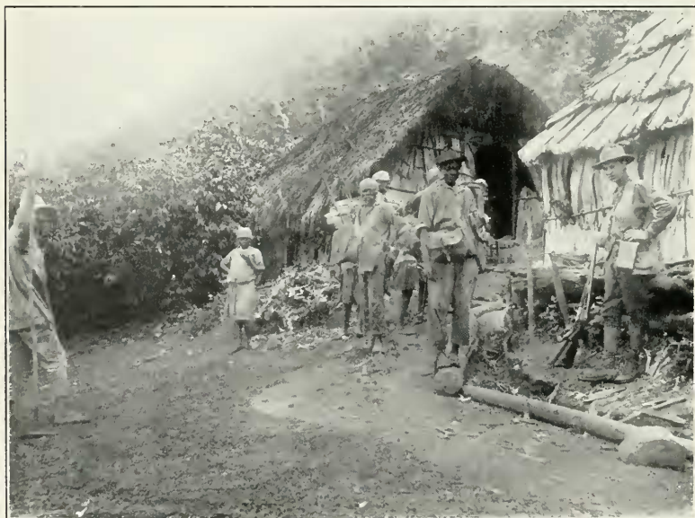
HUTS AT CAYE GODET. On Pic de Macaya, Haiti, April 21, 1931.